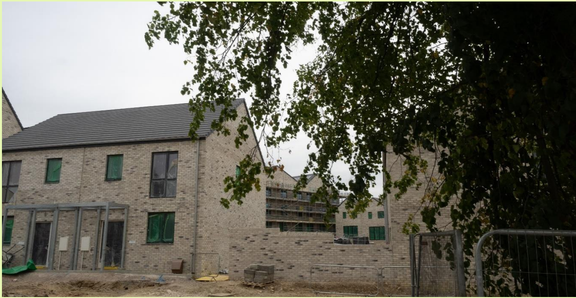
Elderberry Walk, Bristol