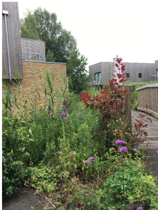
Lower Mill Estate, Habitat First

No. Formal accreditation of individual sites would require involvement by an Approved Assessor. For example, a developer applicant pursuing a BwN Award would need to appoint an Approved Assessor to manage their Accreditation application. This is a two-stage process, and each stage incurs a fee to the applicant. Assessment is a variable fee based on the scale of the scheme and is set by the Assessor; Audit is a variable fee based on the scale of the scheme and is fixed by BwN. There is a list of Approved Assessors on our website , or alternatively your local authority may choose to situate these skills in-house, by selecting suitable planning officers to attend a 3-day training to qualify as an Approved BwN Assessor, details of future trainings can be found on our website .